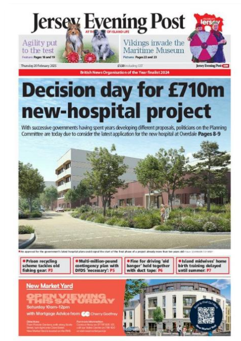
Jersey Evening Post

In addition to the Jersey Evening Post, we produce a range of targeted publications and in-paper supplements, all with complementary e-editions.